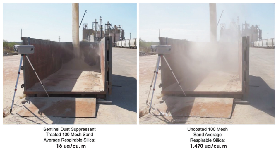
FIGURE 3. A transfer trial that compared treated 100 mesh sand and untreated 100 mesh sand displayed easily visible results.