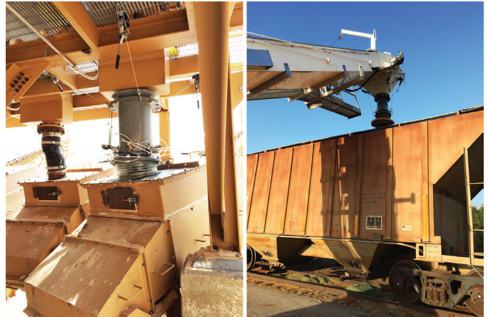
FIGURE 2. The Sentinel dust applicator is used at a sand mine (left) and is attached to a mobile conveyor (right).

Multiple trials have been conducted to demonstrate the dust suppressant's effectiveness at controlling respirable crystalline silica in the field. One such test was conducted at a rail yard in Central Texas. Treated and untreated 100 mesh sand were transferred from a truck to an open roll-off bin using a mobile conveyor (Figure 2). The sand was allowed to fall from a height of about 7 m (25 ft). A measurement instrument was used to record the amount of respirable crystalline silica generated. The 100 mesh sand treated with the dust suppressant had a respirable crystalline silica level of 16 \mu\text{g}/\text{cu. m} of air, while the untreated 100